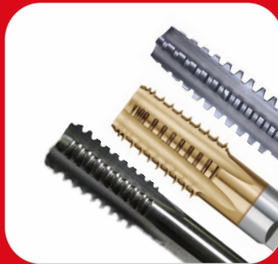
All types of H.S.S. Acme Thread, Buttress Thread, Trapezoidal Thread & Knuckle Thread taps, interrupted thread tap & NgT Taps