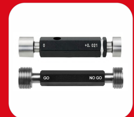
Thread Plug Gauges & Plain Gauges