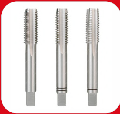
All Type of Ground Thread Taps