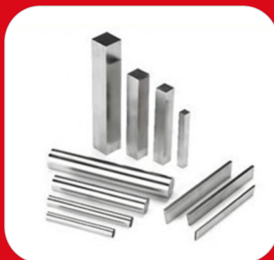
All types of H.S.S. Ground Tool Bits