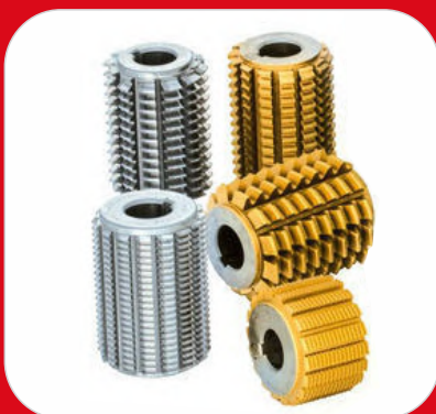
All types of Thread Milling Cutters, Hob Cutters, Pump Rack Cutters & Serration Cutters